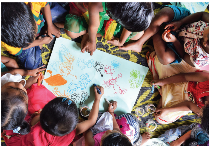
Children draw a picture together in a Play Lab in Bangladesh.

Since 2015, over 115,000 children have been reached through the Play Lab model in Bangladesh, Tanzania, and Uganda through Play Labs in local communities, government schools, and refugee camps in Cox's Bazar.