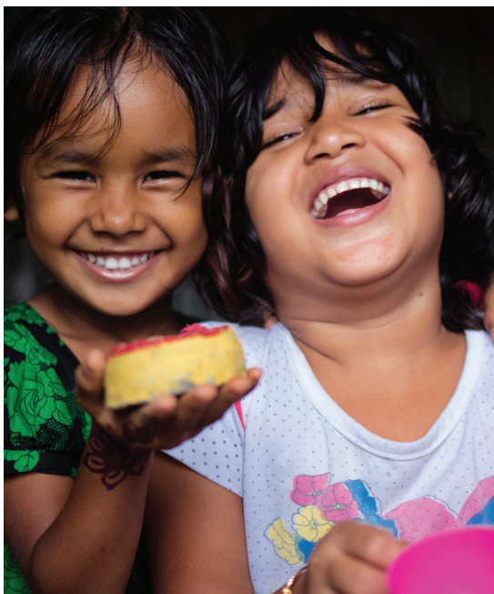
Children engage in dramatic play at a Play Lab.

If successful, these models and their evidence base could have far-reaching implications for young children around the world, particularly in crisis, conflict, or remote settings.